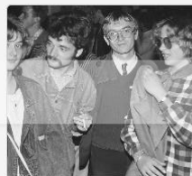
Fashion during times of the Polish People's Republic