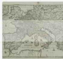
Maps of Europe