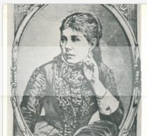
Polish women novelists